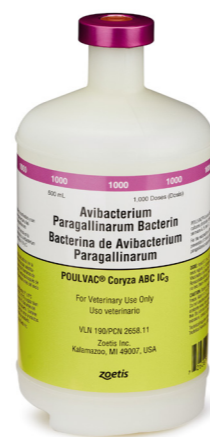
Presentation: 1000 Doses