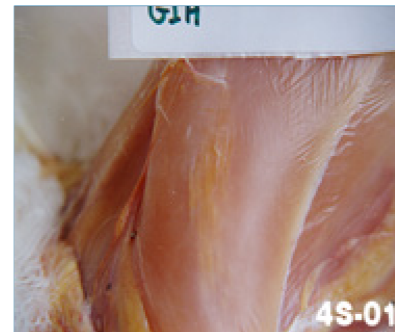
No tissue damage with Coryza Oil-3