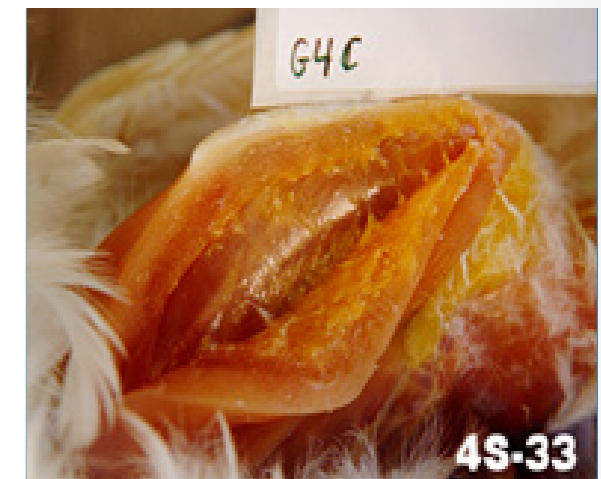
Tissue damage after competitor coryza vaccination